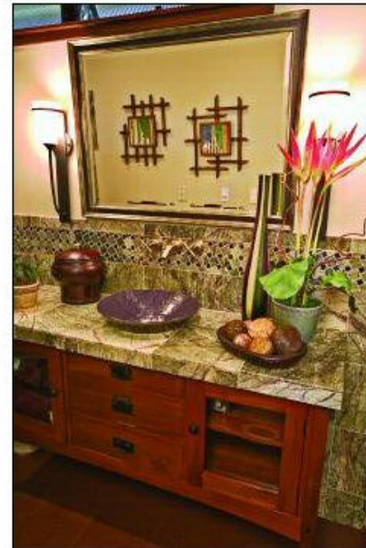
BELOW: In one of the bathrooms Birtcher repurposed an existing dining buffet into a vanity. The vessel sink and faucet are from Kohler. The tile/granite is Rainforest.